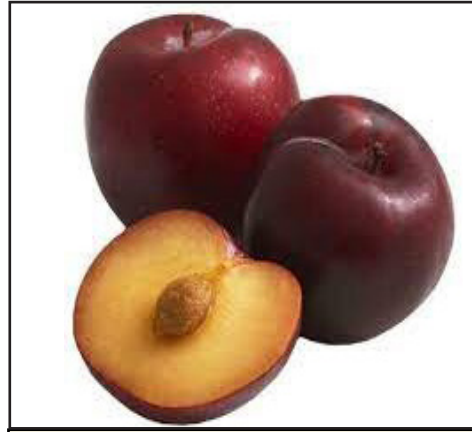
#31850 Plums (Case TP)