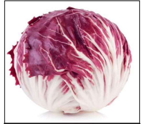
#35040 Radicchio (Case 9-12Ct TP)

AVAILABLE FOR THE WEEK OF 10/24/22 – 10/29/22