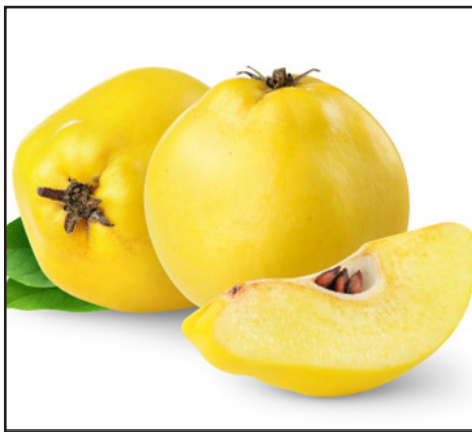
#17777 Quince (Case TP)