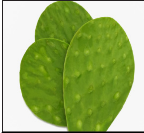
#01188 Cactus Nopales (Pound TP)