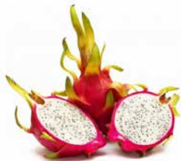
#2511 Dragon Fruit (Pitaya) (case)

Available the Week of 11/5/18 – 11/10/18