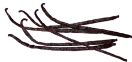
#2515 Vanilla Beans (each)