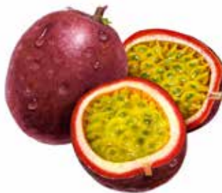
#31120 Passion Fruit (flat)